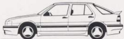
Saab 9000 Carlsson