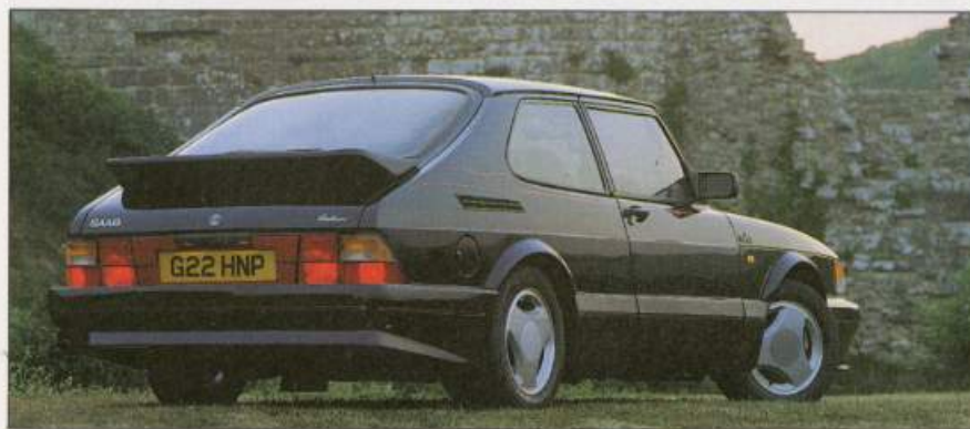
Cars shown are fitted with optional equipment.

confidently and effectively. The best of engineering and design combined with a fascia which is both stylish and informative – a perfect blend of form and function.