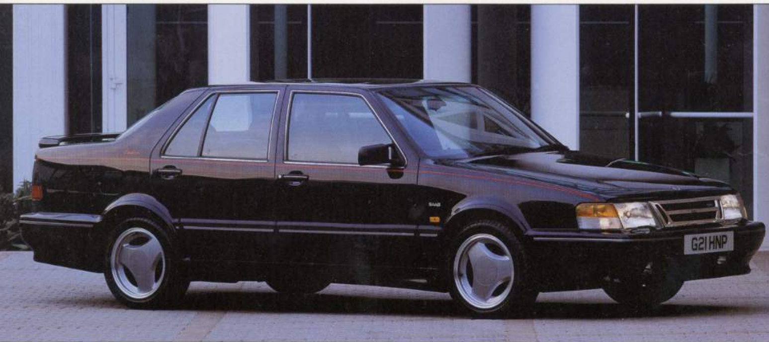
Cars shown are fitted with optional equipment.

The driver and passengers are well cared for within the spacious interior, the ride is not only smooth but quiet and extremely comfortable with individual touches which