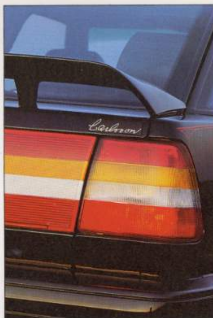
Cars shown are fitted with optional equipment.

The Saab 9000 and CD Carlsson models have been fitted with Saab Direct Ignition (DI). A new system that is set permanently to last for the entire life of the car with no moving parts. This new system ensures