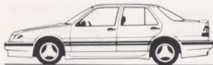
Saab CD Carlsson