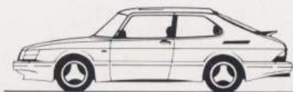
Saab 900 Carlsson

Three product lines of Saab cars are available: the Saab CD Carlsson, Saab 9000 Carlsson and Saab 900 Carlsson.